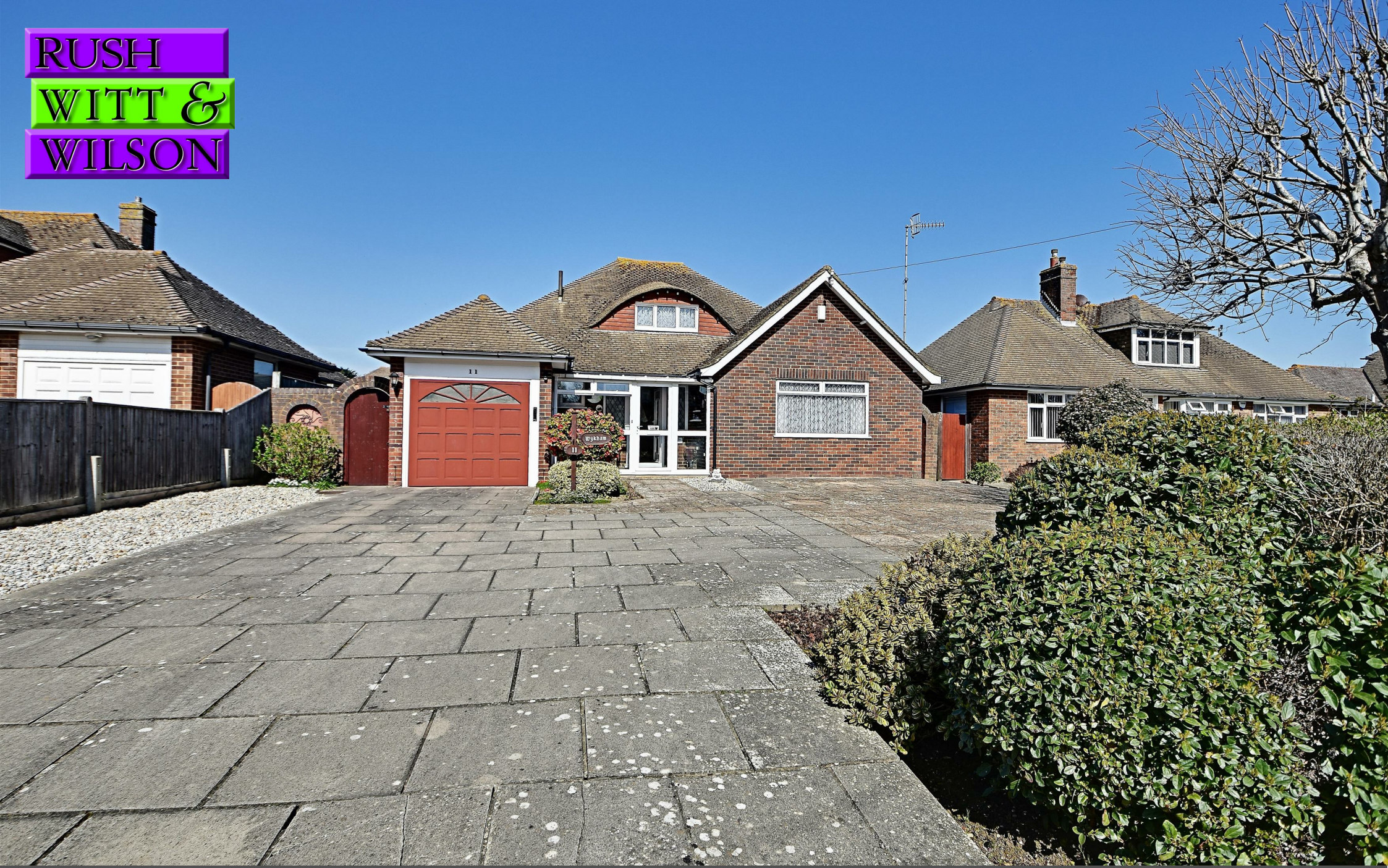
11 Collington Lane East, Bexhill-On-Sea, Sussex TN39 3RG £550,000